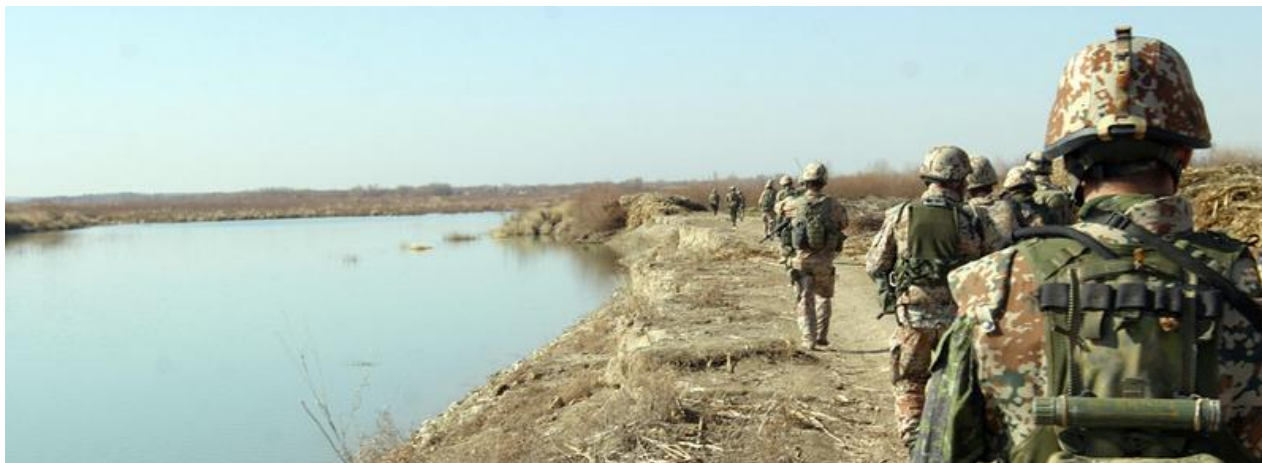
Danish soldiers on patrol in Afghanistan